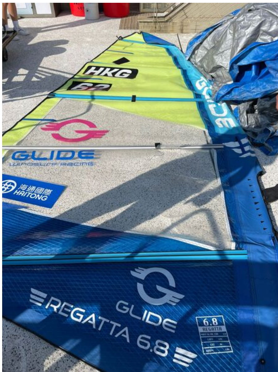
HKG62a.jpeg 679 KB

The Sail 5th Panel was broken and cannot be repaired