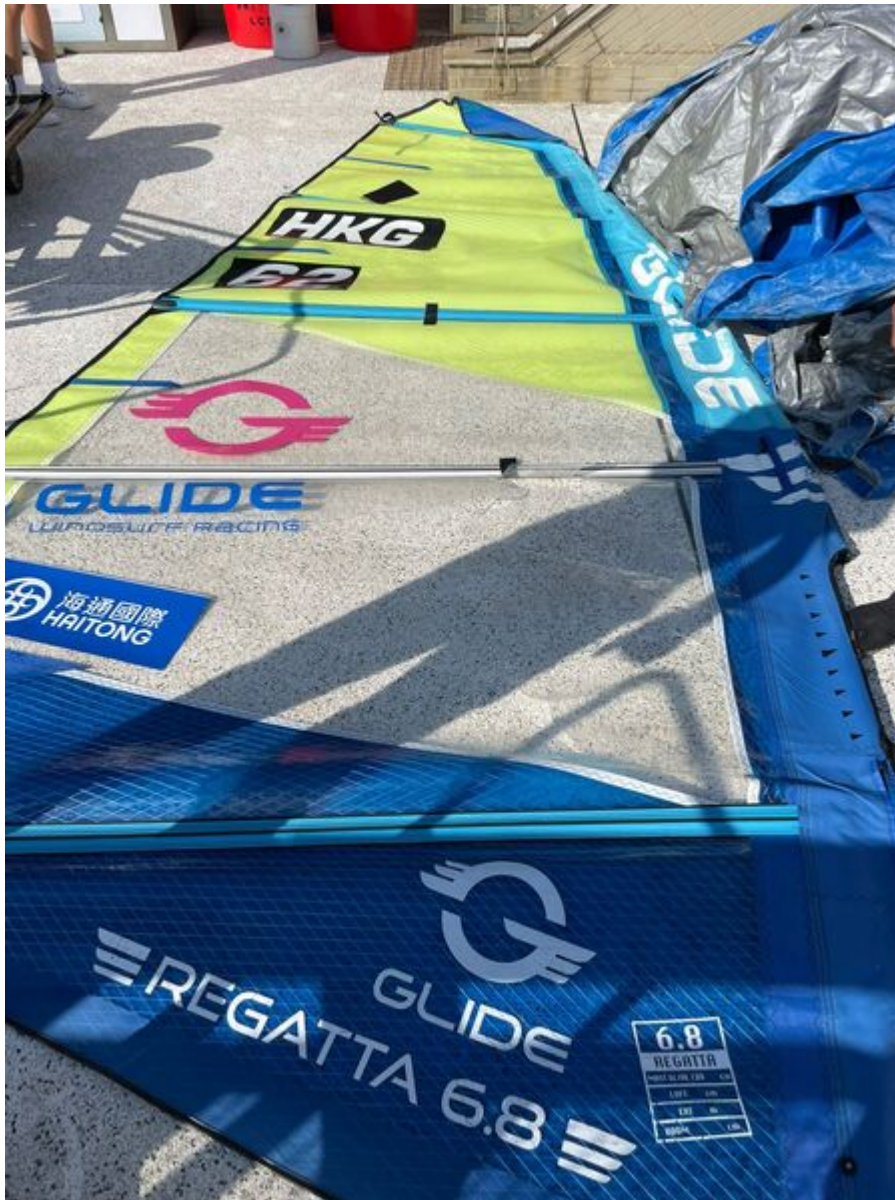
HKG62a.jpeg 679 KB

The Sail 5th Panel was broken and cannot be repaired