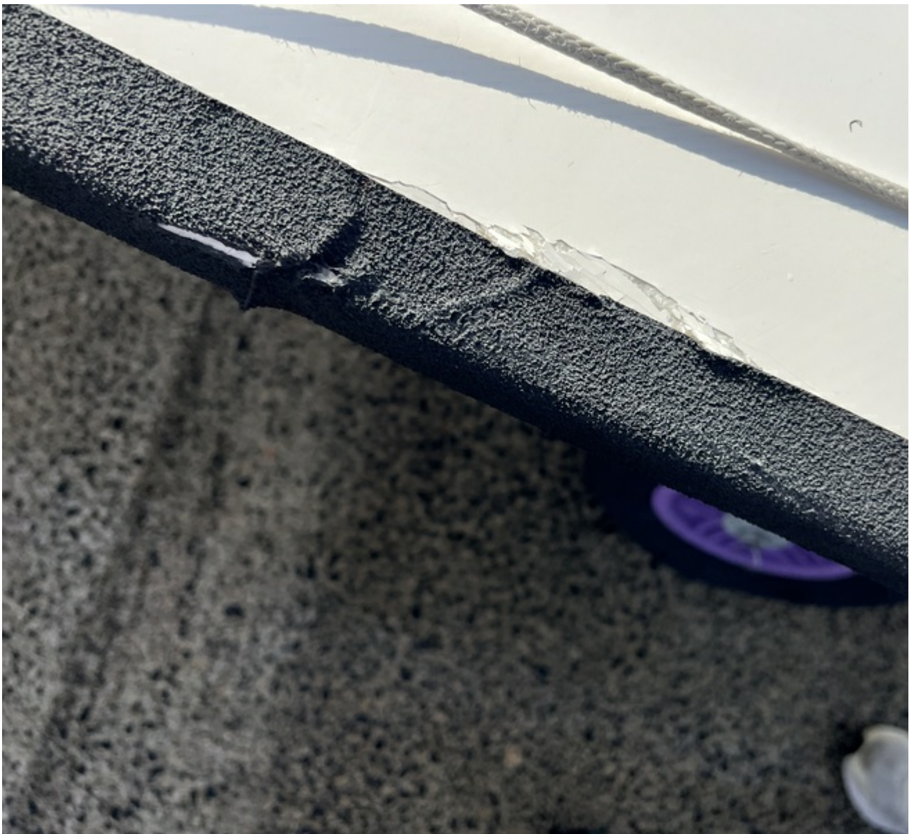
IMG_2370.jpeg 3.44 MB