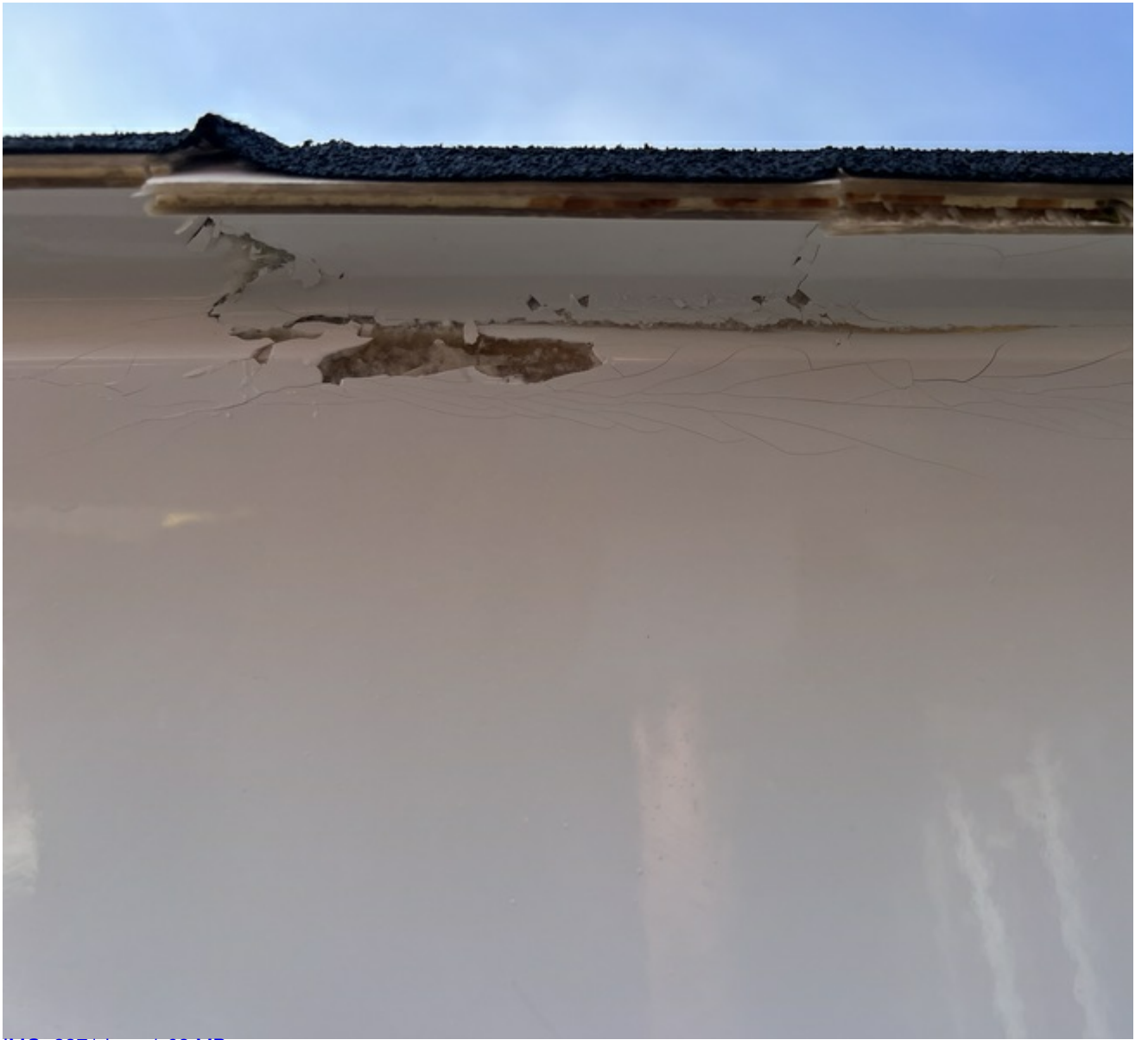
IMG_2371.jpeg 1.63 MB