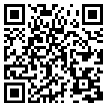
Submit Request for Hearing

Notice: This electronic notice board is the Official Notice Board (ONB) for this regatta.