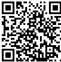
Submit Request for Hearing

Notice: The Official Notice Board (ONB) is still the only official source of information for this regatta.