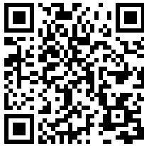
Submit Request for Hearing

Notice: This electronic notice board is the Official Notice Board (ONB) for this regatta.