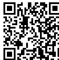
Submit Scoring Inquiry