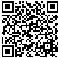
Submit Request for Hearing

Notice: This electronic notice board is the Official Notice Board (ONB) for this regatta.