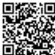
Official Notice Board

Scan this QR-Code with your device to access the Official Notice Board (ONB)