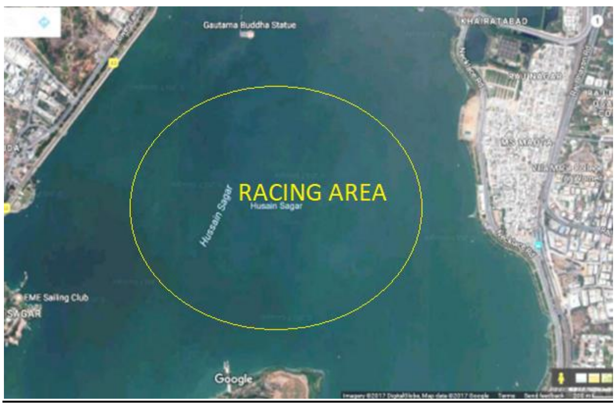
Hussain Sagar Lake

Note : The diagram depicts general/ approximate area. Diagram is not to Scale.