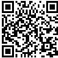
Submit Request for Hearing

Notice: This electronic notice board is the Official Notice Board (ONB) for this regatta.