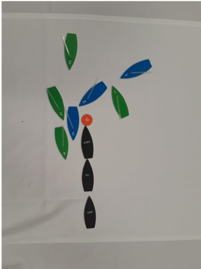
Protestor version above (Avet green, Big Apple blue, breakwater black/orange)

See 2 attached images, wind from right to left in both images