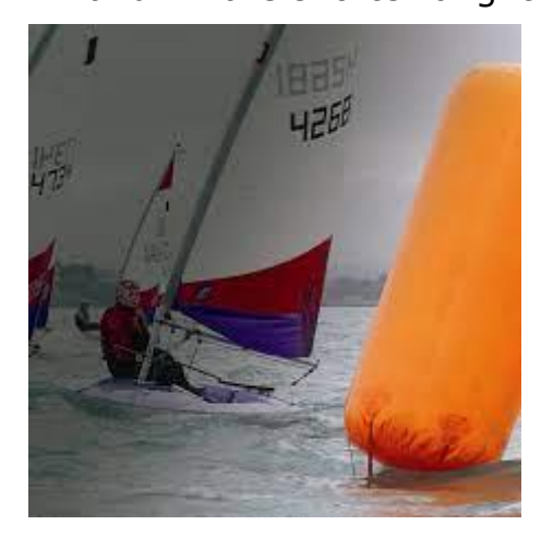
Mark 1 and Mark 2

6.1 Marks 1 and 2 are tall, cylindrical orange inflatable marks. Marks 3A, 3B, 4A and 4B are shorter bright orange inflatable marks.