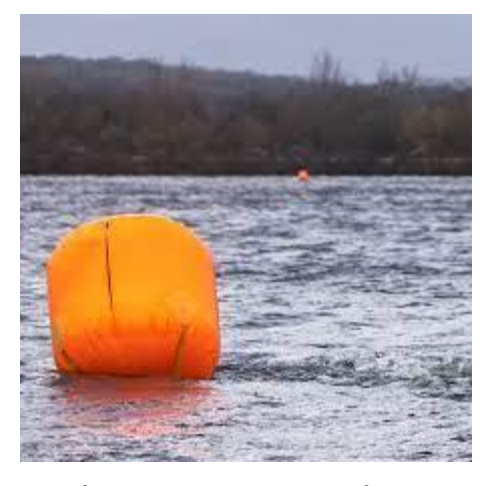
Marks 3A, 3B, 4A and 4B