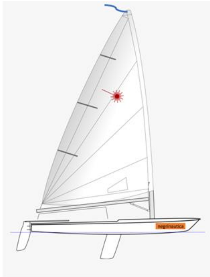
Stickers: On both side Coloured band: on the top the mast