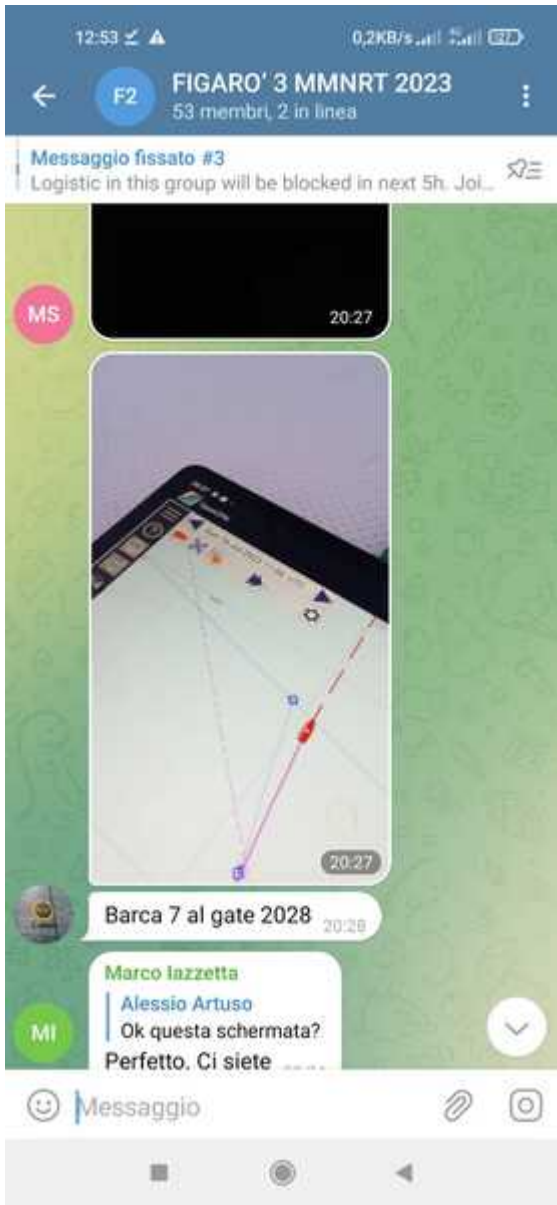
IMG-20230717-WA0002.jpg 89.3 KB